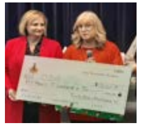
A "Thank You" is just not enough!

did not just match pledged $5,000 the but instead matched it $ for $ and even rounded it up to а total of $15.000!