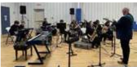
OSB Jazz Band

For entertainment, we had live performances from our Jazz band ,