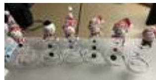
Aren't they adorable?