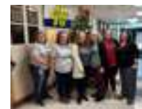
Front Office Crew