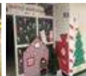
B3 dorm (boys)