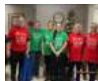
Merry Christmas from the Clinic