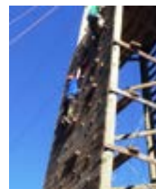
Cameron on the rock climbing wall