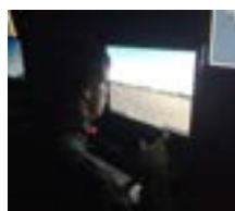
Cameron in flight simulator

In this military-style program, Tai and Cameron experienced many realistic combat scenarios.