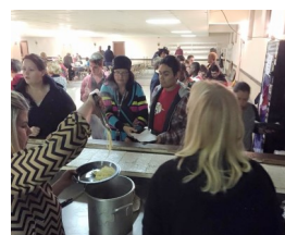
Spaghetti fun at the Masons of Trinity Lodge