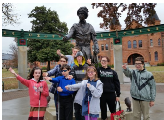
MS students in front of the Sequoyah statue at NSU Tahlequah campus