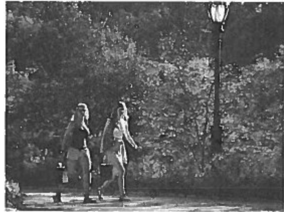
Walking is a good way to deal with stress.

Whether they're dealing with financial setbacks, health problems, or workplace difficulties, mentally strong people don't let stress drag them down.