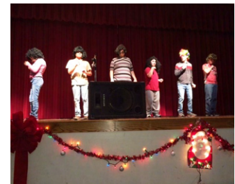
OSB students performing at Ben Franklin Science Academy