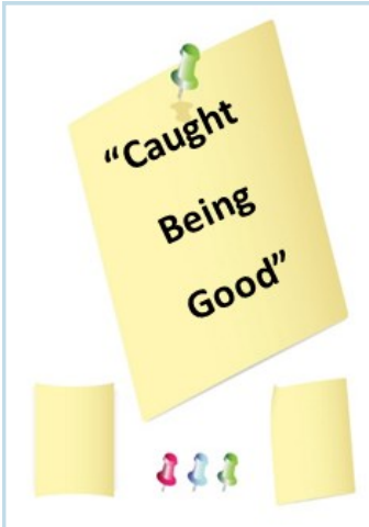
Posted Notes image with note "Caught being Good"