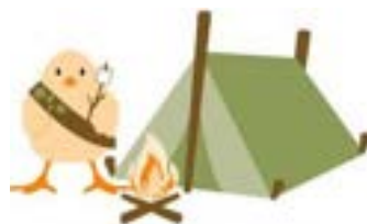
THIS CHICK LOVES TO CAMP

The girls will participate in fun and challenging sporting events! They will also have an opportunity to explore a variety of different "Live Healthy, Lead Healthy" activity stations.