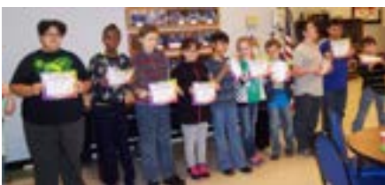
The Braille Club had their last meeting on March 8, 2016 and