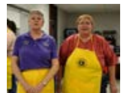
Lions Club members