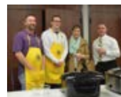
Lions Club members