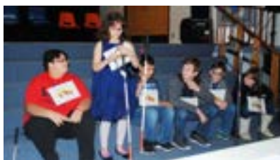
Contestants awaiting their turn