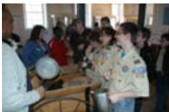
Troops 672 & 602 at Ft. Gibson Fort, examining historical items

On Friday, the two troops visited the Fort Gibson Historic Site.