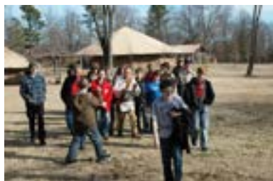
Troops 672 & 602 at the Cherokee Heritage Center Indian Village

The troops also visited the Cherokee Heritage Center in Tahlequah on Friday. They took a living history tour of a 1710 Cherokee village while working on the Indian Lore Merit Badge .