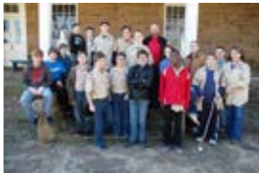
Troops 672 & 602 at Ft. Gibson Barracks in front of the original Oklahoma School for the Blind barracks

They toured the Barracks where the School for the Blind was founded by Lura Rowland in 1897. While exploring the school's heritage, they also met one of the requirements for Citizenship in the Nation Merit Badge by visiting a site listed on the National Register of Historic Places.