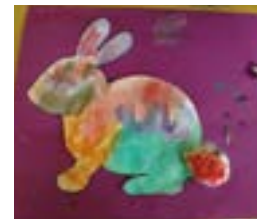
Water Color Bunny