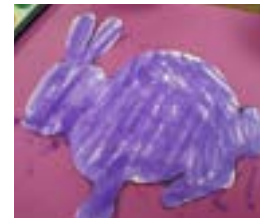
Water Color Bunny